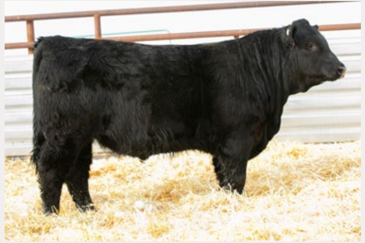
Lot 20 HIGHLAND 204H

HOMOZYGOUS BLACK - TESTED • HOMOZYGOUS POLLED TESTED