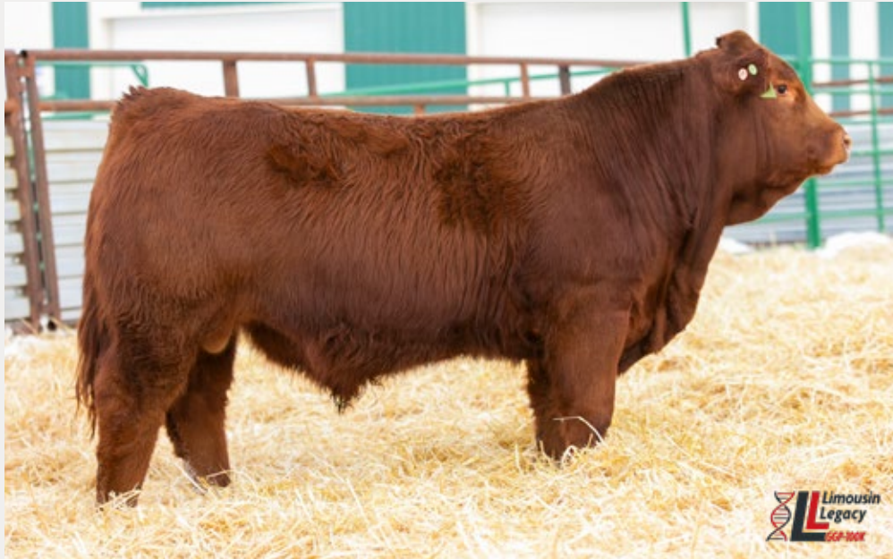
Lot 10 HIGHLAND HISTORY 30H