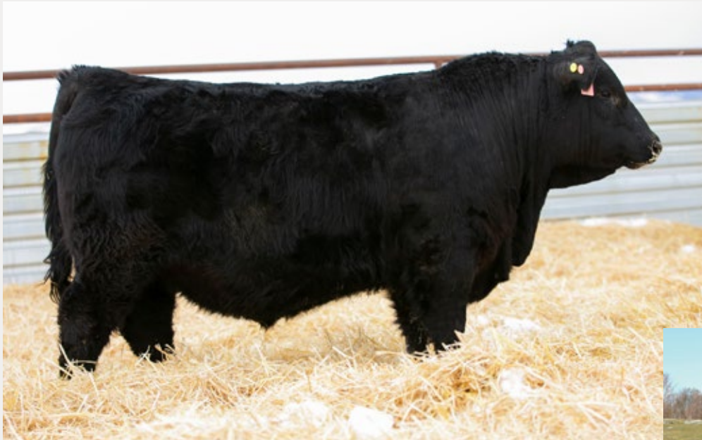
Lot 31 HARPER 702