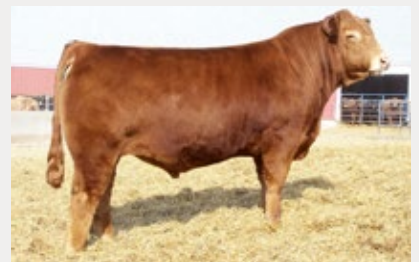
WULFS X-BRACING 6294X Maternal Grandsire of Lot 4