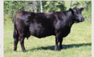
HIGHLAND ALLY 39A Dam of Lot 8