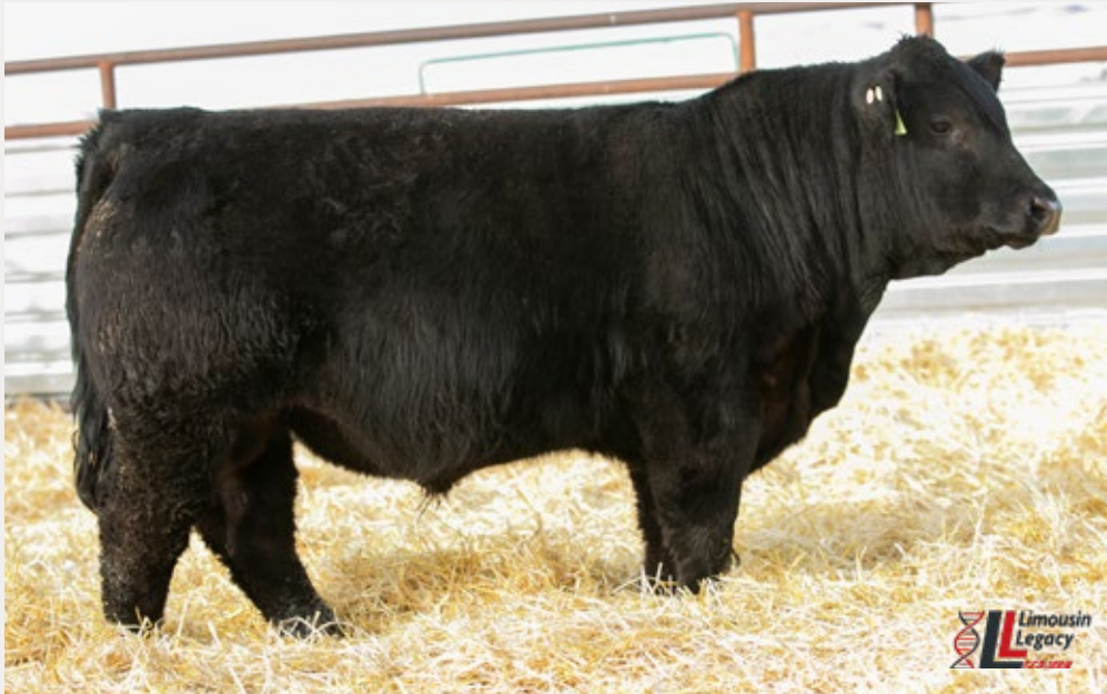
Lot 3 HIGHLAND HAWKEYE 6H