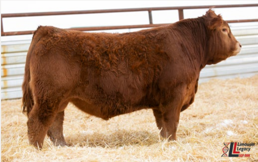
Lot 5 HIGHLAND HUMMER 12H