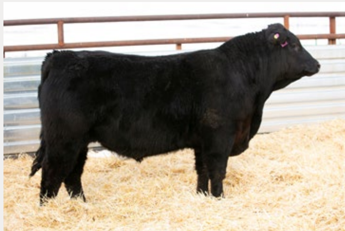
Lot 21 HIGHLAND 202H

HOMOZYGOUS BLACK - TESTED • HOMOZYGOUS POLLED - TESTED