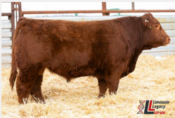
Lot 9 HIGHLAND HARLEY 23H

His dam, Highland Faline 14F produced RAM 23H as a first calf heifer and we think that she will have a great future at Highland.