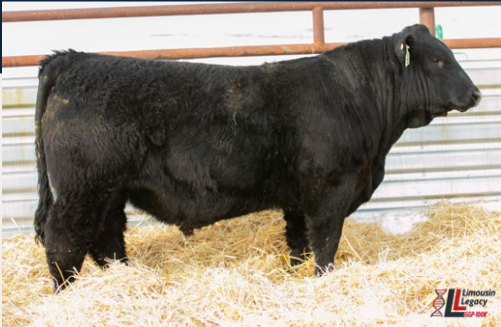
Lot 1 HIGHLAND HEART BREAKER 13H

All Limousin bulls are parentage verified & 100K tested