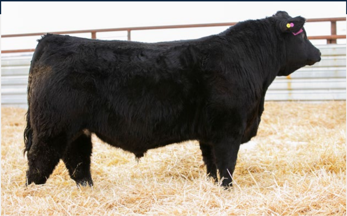
Lot 18 HIGHLAND 201H