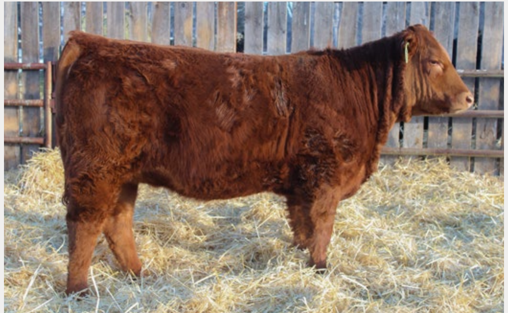
Lot 36 HIGHLAND HOLIDAY 7B