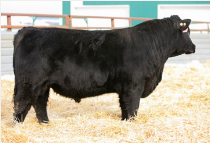
Lot 25 HIGHLAND HIGHDOLLAR 6H