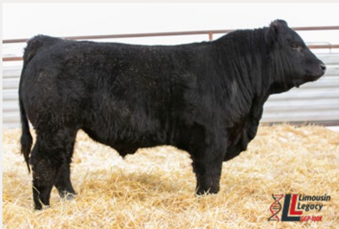
Lot 12 HIGHLAND HARRIS 32H