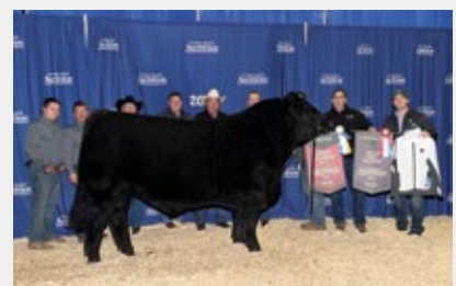
HIGHLAND BOSTON 30B

HOMOZYGOUS BLACK – TESTED • HOMOZYGOUS POLLED – TESTED