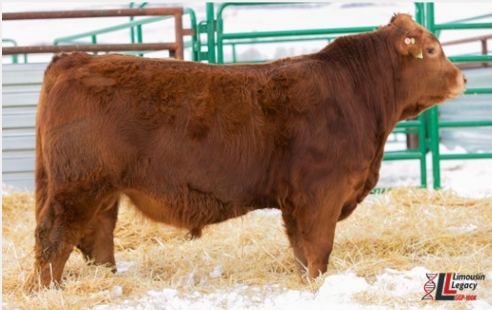
Lot 4 HIGHLAND HANOUPER 10H