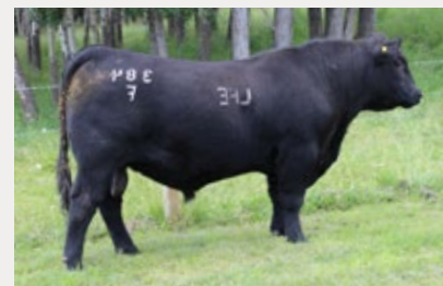
LFE BA LEWIS 384F

Sire of Lot 23, 25, 26, & 27 High selling bull at Lewis Farms 2019 Bull Sale to Highland