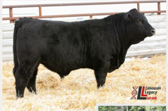
Lot 8 HIGHLAND HUNTER 20H