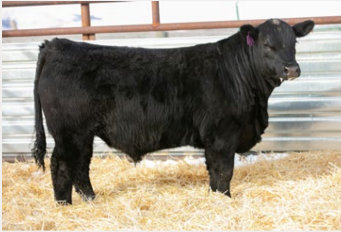
Lot 19 HIGHLAND 203H