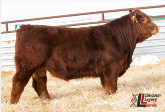
Lot 7 HIGHLAND HAT TRICK 17H