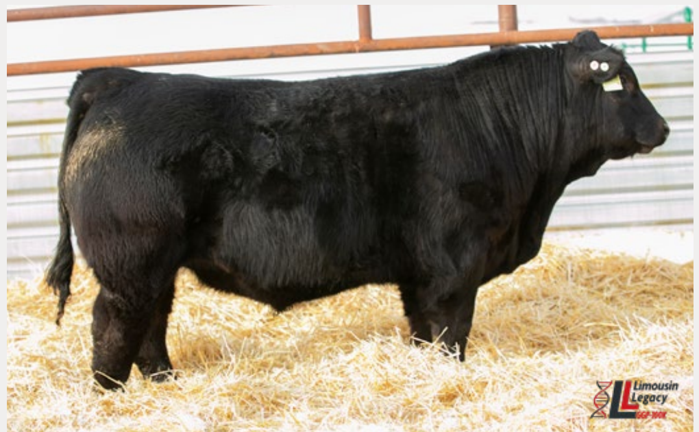
Lot 14 HIGHLAND HOT TICKET 37H