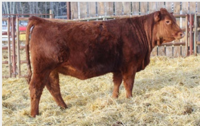
Lot 33 HIGHLAND HEATHER 15H

A daughter of our oldest Limousin cow who had another heifer calf in 2021. She also has four other daughters at Highland and sons have been sold to Swenglers at Beiseker and Blaine Treloar, Okotoks