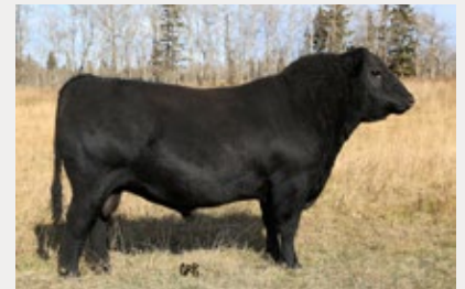
BROOKMORE BISMARCK 19A Maternal Grand sire of Lot 28