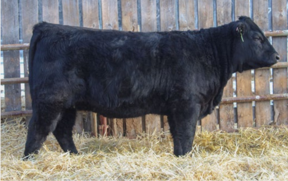
Lot 35 HIGHLAND HONEYSUCKLE 4H