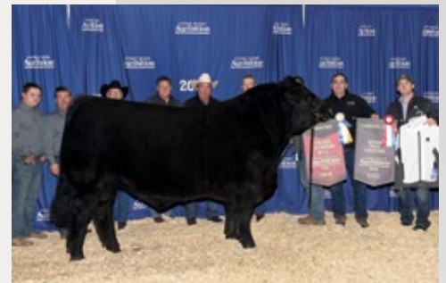
Reference Sire HIGHLAND BOSTON 30B