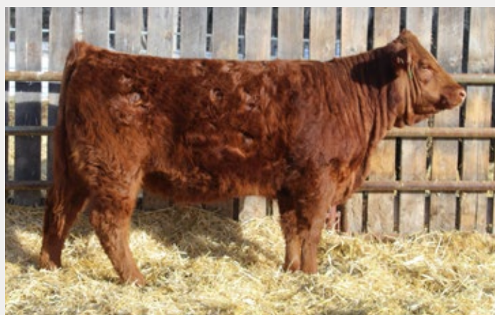
Lot 34 HIGHLAND HEIRESS 33H