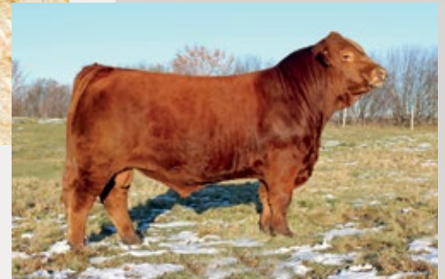
Reference Sire GREENWOOD CURVE BALL 42B