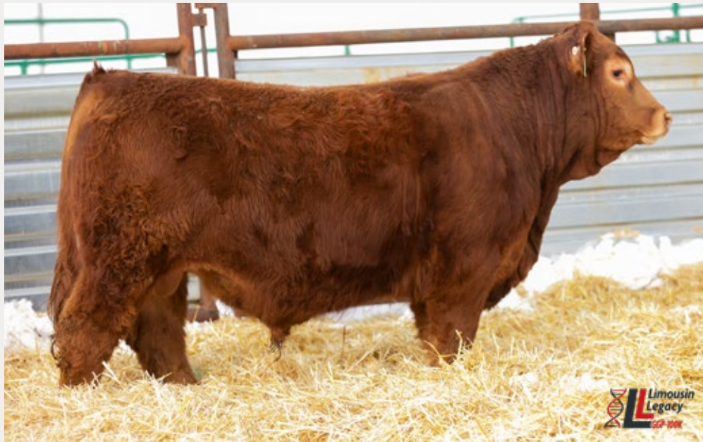
Lot 13 HIGHLAND HAMILTON 36H