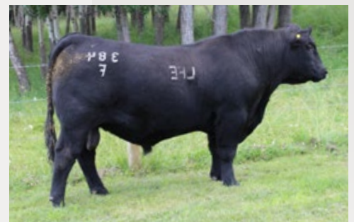
Reference Sire LFE BA LEWIS 384F