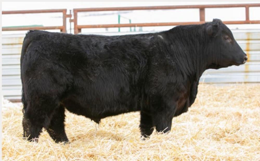
Lot 24 HIGHLAND HIGHDOLLAR 5H

Sire of Lot 23, 25, 26, & 27 High selling bull at Lewis Farms 2019 Bull Sale to Highland