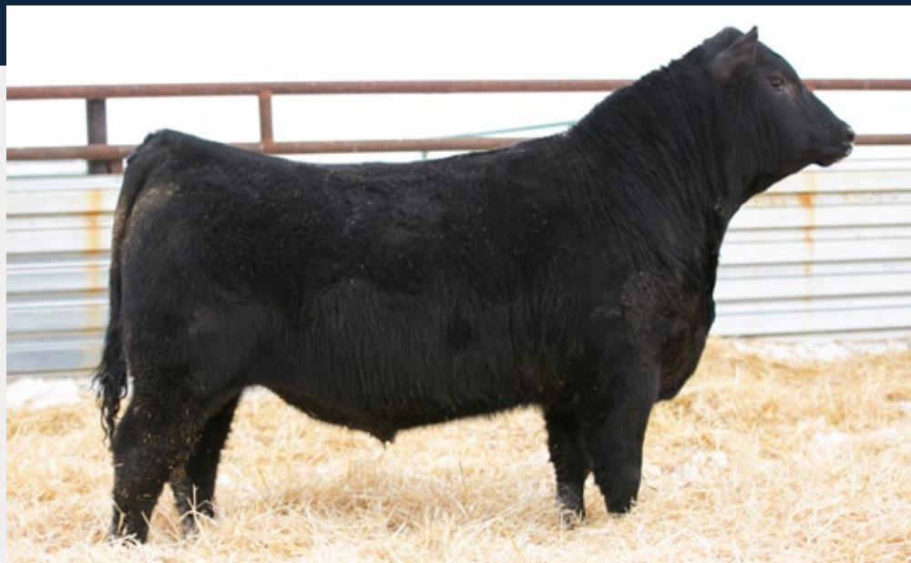
Lot 23 HIGHLAND HIGHDOLLAR 1H