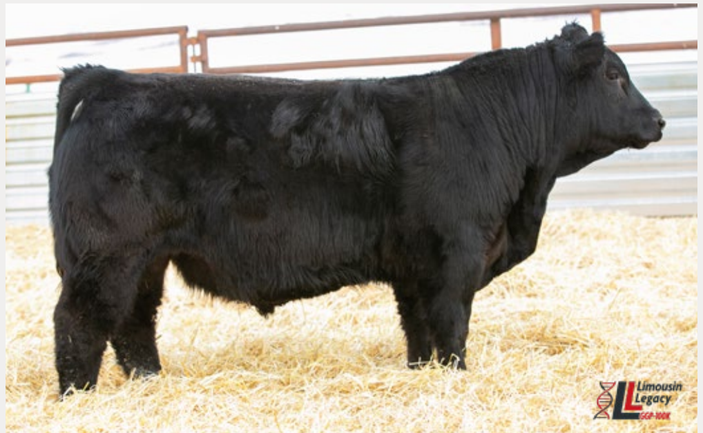
Lot 6 HIGHLAND HERO 16H