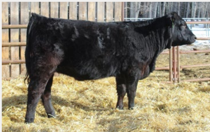
Lot 32 HIGHLAND HALO 2H