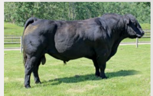
Reference Sire GREENWOOD CANADIAN WAYS 711C