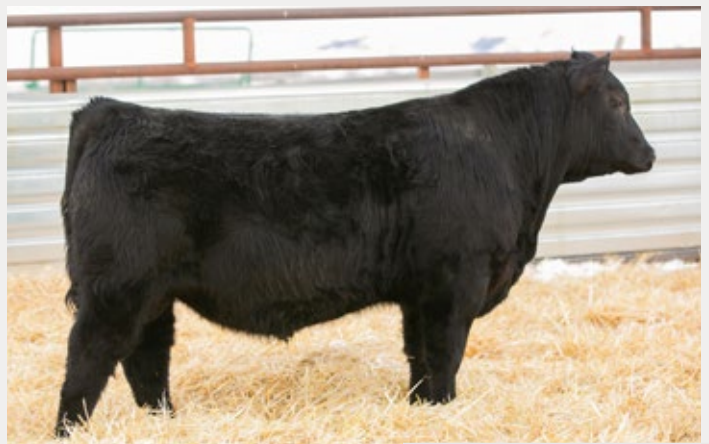
Lot 27 HIGHLAND HIGHDOLLAR 09H

His dam we purchased from Johnson Livestock in Saskatchewan and she has also produced a replacement female for us in her first calving.