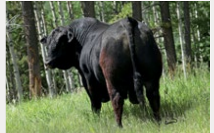
RPY PAYNES DERBY 46Z Maternal Grandsire of Lot 3