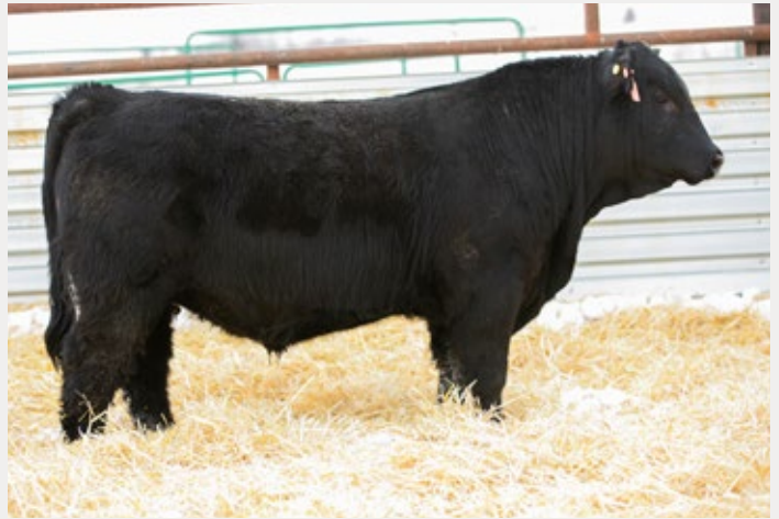
Lot 26 HIGHLAND HIGHDOLLAR 7H

His dam produced a top selling bull in last years' sale going to Camas Creek Ranch, White Sulphur Springs, Montana.