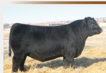
S A V MISSOURI RIVER 8025