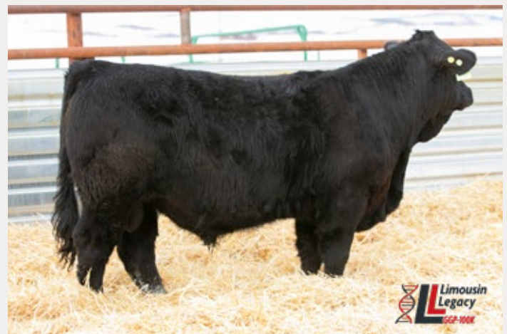
Lot 17 HIGHLAND BLACK HAWK 41H