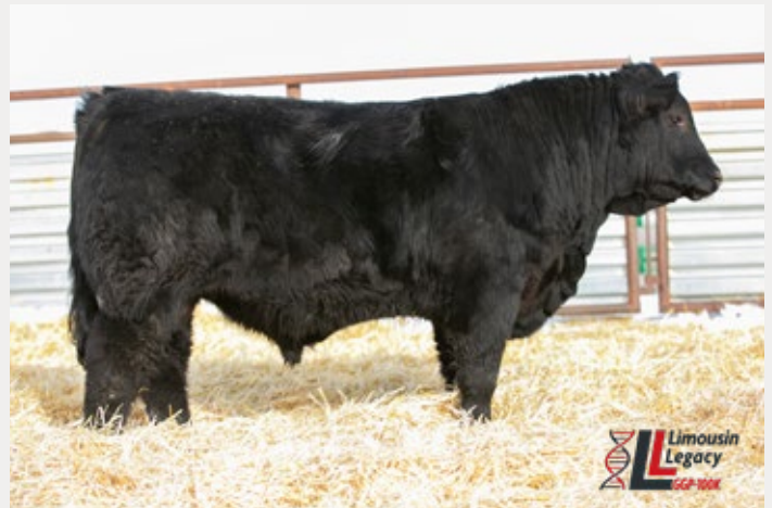
Lot 22 HIGHLAND HIGHTOWER 27H