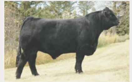
MAGS WAR ADMIRAL