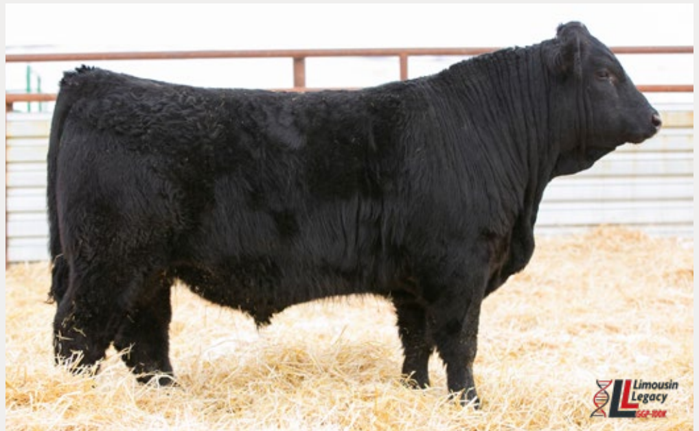
Lot 2 HIGHLAND HITCHHIKER 14H